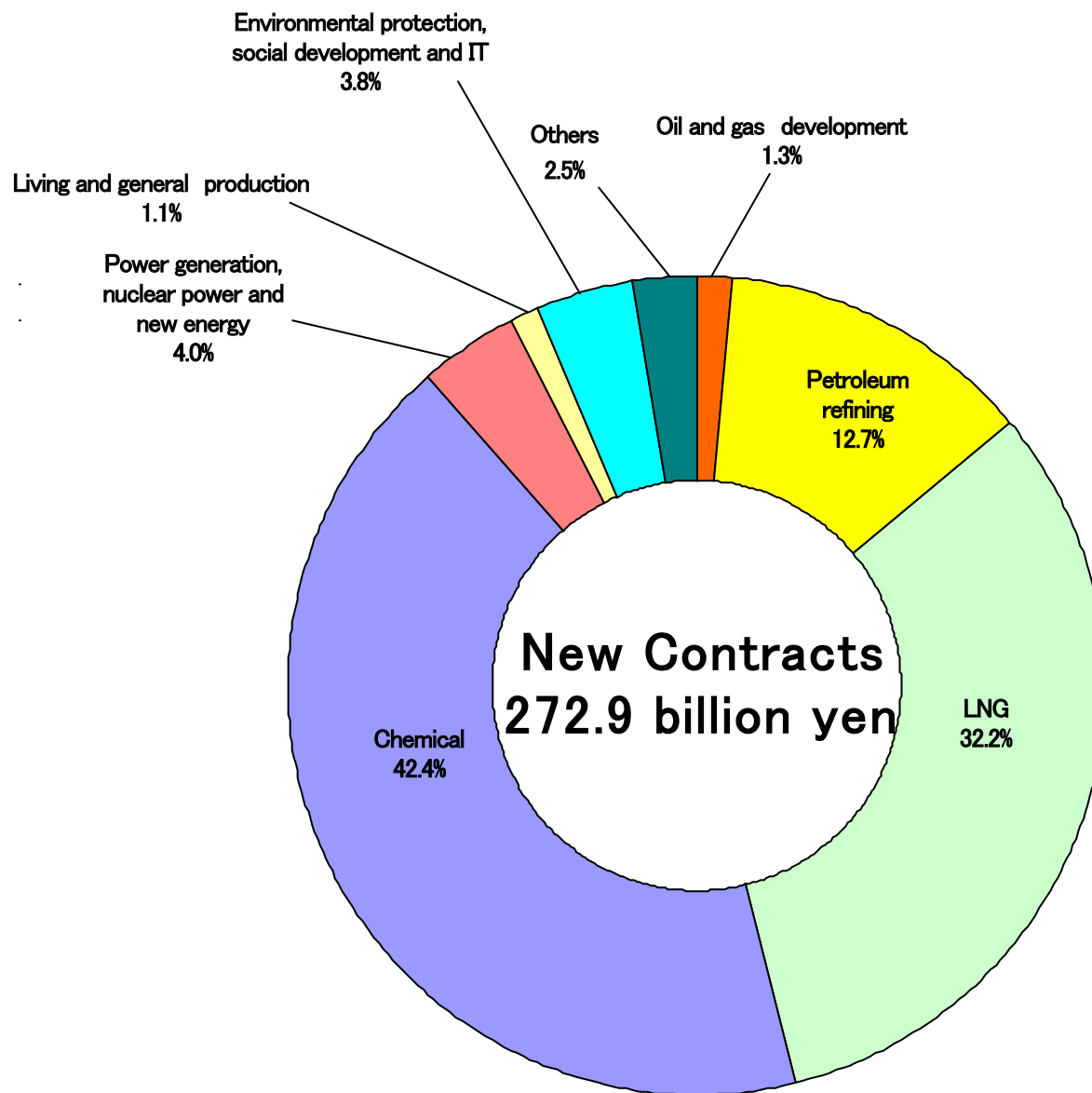
Sept. 2013 New contracts by business sector