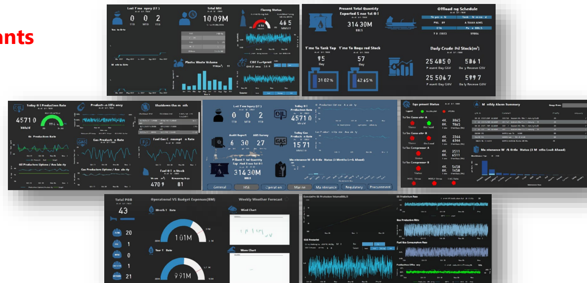
Example of KPI Dashboards for remote operations monitoring